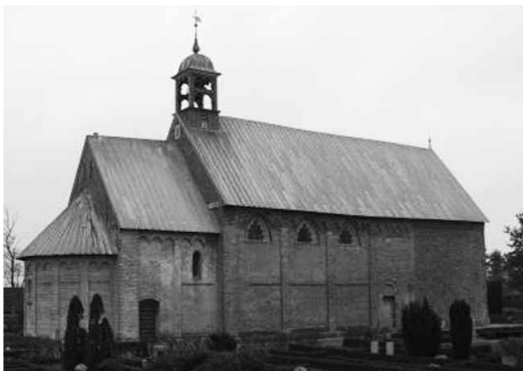
Figure 4. The church at Hviding, Denmark, built with Rhenish tuff.