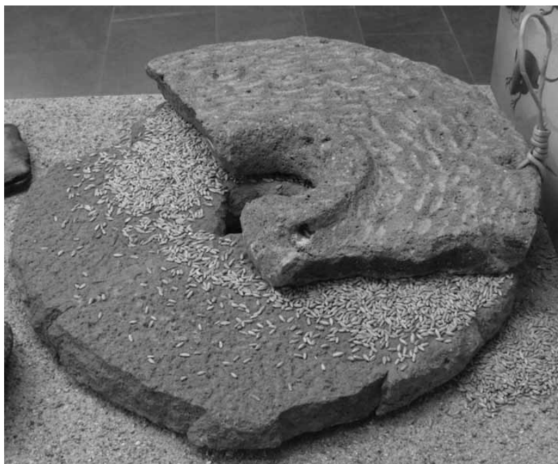
Figure 1. Quern-stone made from Mayen lava.

Among archaeological finds those originating from distant places, luxury items and precious metals often attract the most attention from scholars. As a consequence, research interests are often focussed on the long distance trade of luxury goods. Utilitarian goods, even though being subject to long distance trade, have been largely neglected. This applies also to the trade in stones.